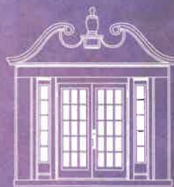
Levy Baptist Church

LITTLE BABY ON THE HAY, SOON THERE'LL BE ANOTHER DAY, WHEN NAILS SHALL PIERCE YOUR HANDS AND FEET, AS YOU PROVIDE OUR SIN'S DEFEAT.