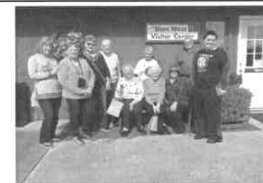
W.O.M. trip to Heifer International in Little Rock on October 23rd